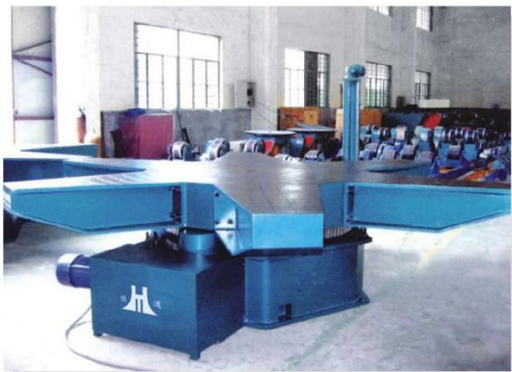
> 30T 回转平台 / 30T Rotating table