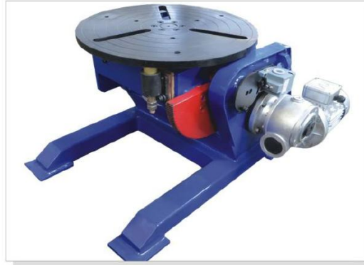
> ZHB-01焊接变位机 / ZHB-01 Welding Positioner