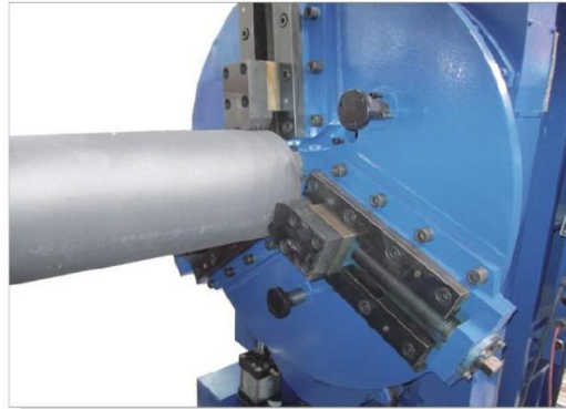
> 变位机带卡盘 / Positioner with chuck