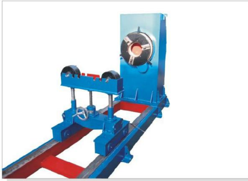
> 托轮式头架变位机 / Headstock & Support roller