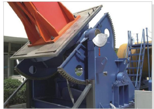
> 35吨单座变位机翻转 / Tilting of 35T single-base Positioner