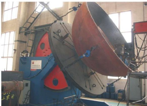
> 35吨焊接变位机 / 35T Welding Positioner