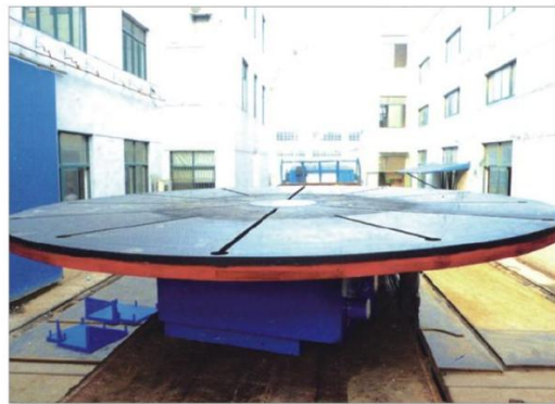
> 50T 回转平台 / 50T Rotating table