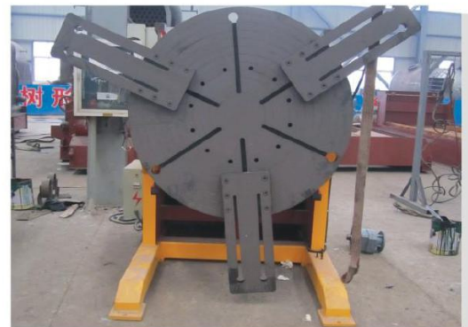
> 标准焊接变位机 / Welding Positioner