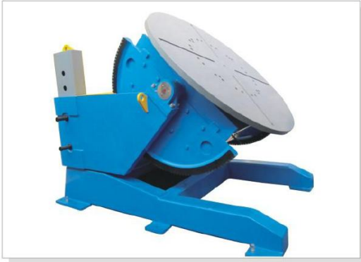
> 螺钉升降变位机 / Bolt Height Adjustable Positioner