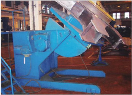
> 单座变位机使用中 / Using of single-base Positioner