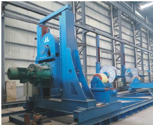
> RGJ 绕管机 / RGJ Pipe winding center