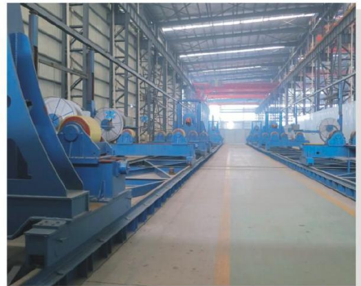
> RGJ 绕管机 / RGJ Pipe winding center