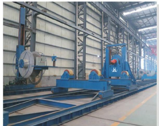
> RGJ 绕管机 / RGJ Pipe winding center