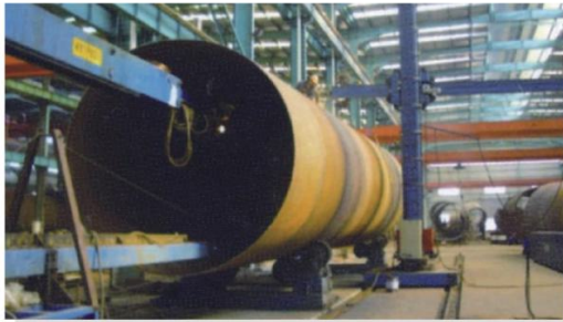
> 内环缝焊接 / Inner seam welding