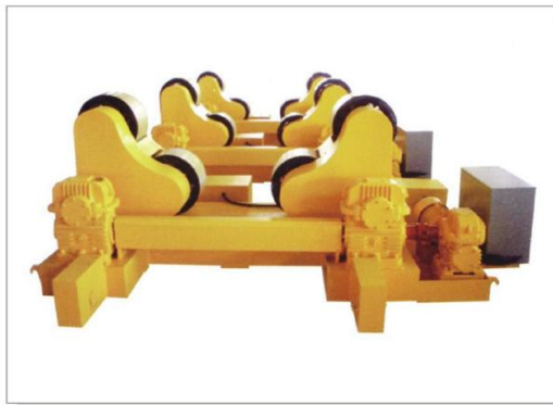
➢ 60-80T电动行走式滚轮架 / 60-80T Walking welding rotator