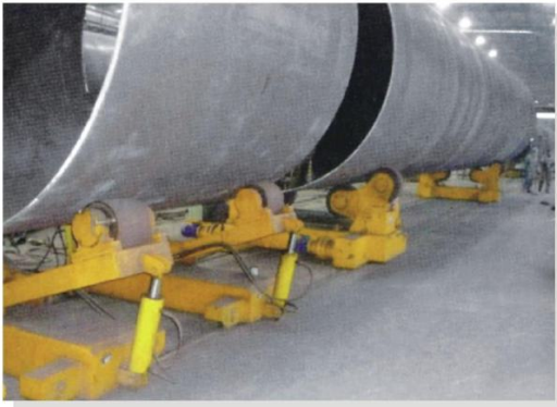
➢ 液压顶升行走式组对滚轮架 / The hydraulic rise and walking welding rotator for connection