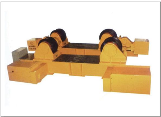
➢ 喷砂、喷漆房专用滚轮架 / Special rotator for painting and spraying sand