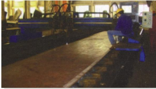
> 数控下料 / Digital control cutting material