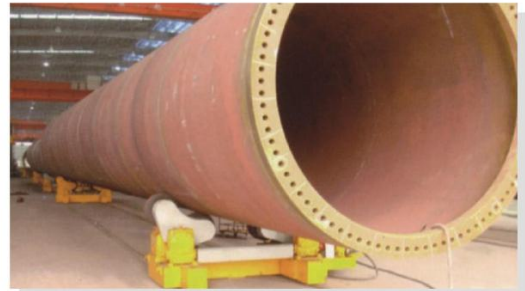
> 外环缝焊接 / Outer seam welding