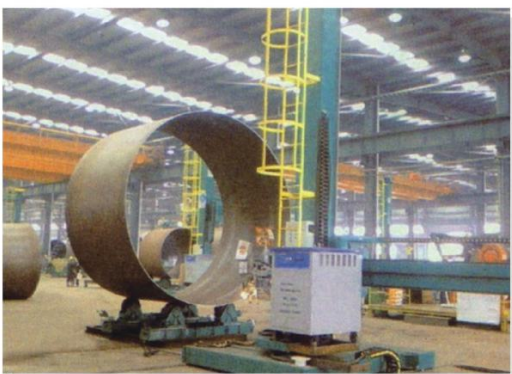
➢ 焊接操作机 / Welding manipulator