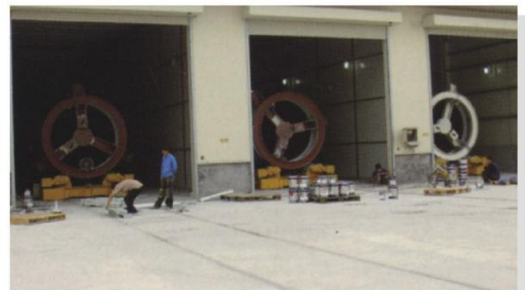
> 塔筒喷漆 / Tower tube painting