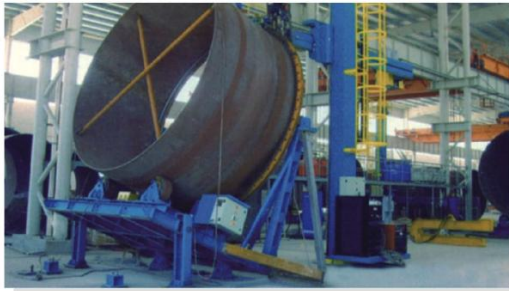
> 法兰焊接 / Flange welding