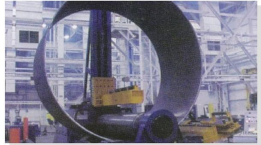
> 卷板机卷筒 / Rolling