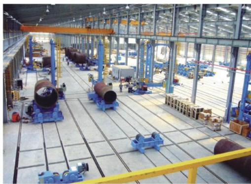
➢ 焊接操作机工作现场 / Working place of welding manipulator