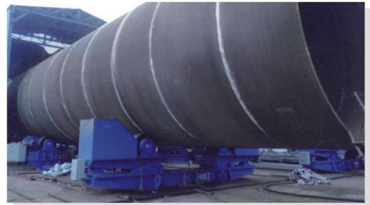
> 重型塔筒组对焊接 / Heavy-duty tower fit-up welding(800T)