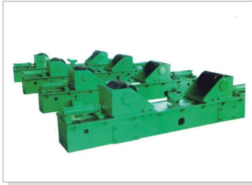
➢ 液压组对滚轮架 / Hydraulic welding rotator for connection