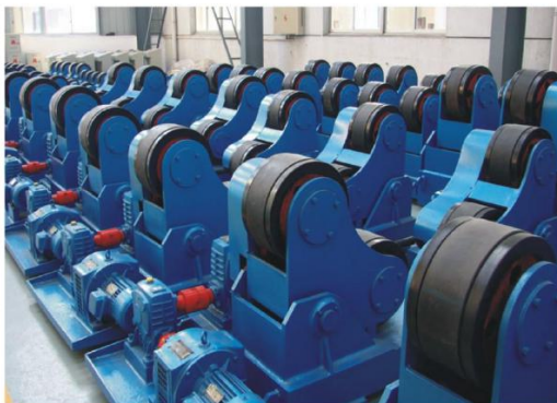
> 成品间一角 / Corner of stock