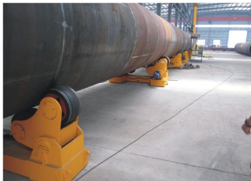
➤ 滚轮架使用现场 / Using of welding rotator