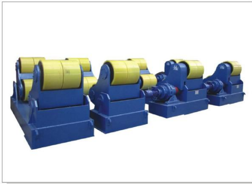
> 双聚氨酯滚轮架 / Welding rotator with double rollers