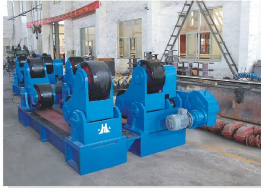
➤ 100吨钢轮滚轮架 / 100Ton with Steel Rollers