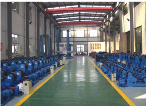
➤ 存放滚轮架的车间 / Stock