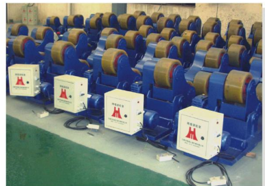
> 聚氨酯滚轮架系列 / PU Series