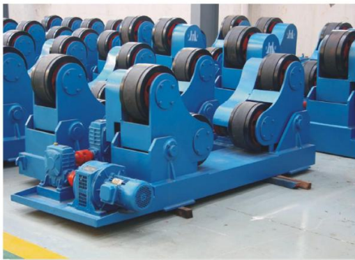
> 60吨系列 / 60T series