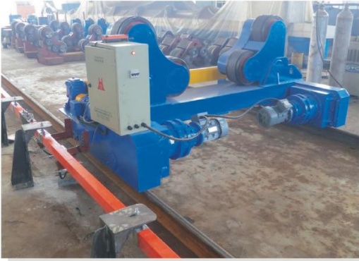
➤ 移动式滚轮架 / Movable welding rotator