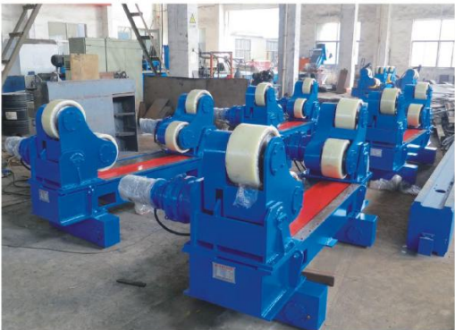
➤ 移动式聚氨酯滚轮架 / Movable and with PU Rollers