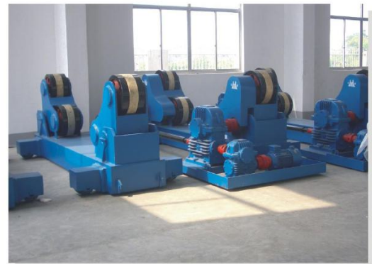
> 150吨白橡胶加金属轮滚轮架 150T white rubber and steel rotator