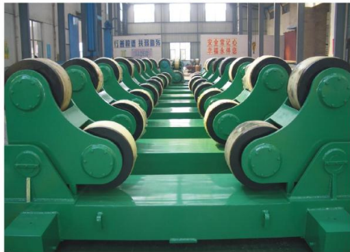
➤ 100吨聚氨酯滚轮架 / 100T PU rotators