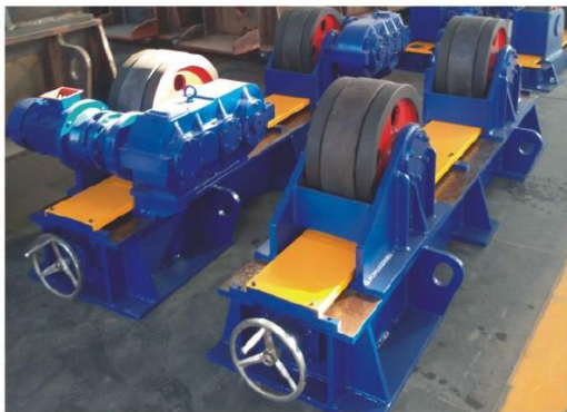
> 丝杆调节滚轮架 / Lead Screw adjusted welding rotator