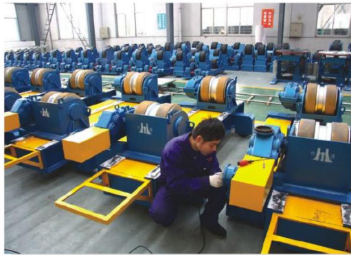
> 可调式聚氨酯行走滚轮架 / Conventional movable rotator (PU roller)