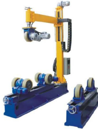
> 2吨压紧式滚轮架 / 2Ton Cramp Rotator