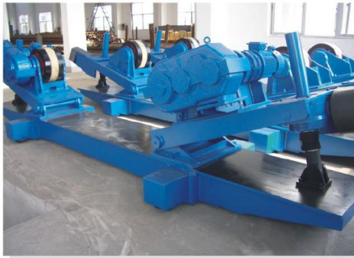
> 特制可调式滚轮架 / Special rotator