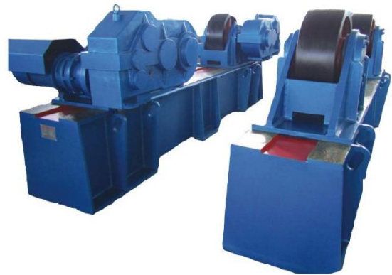
○ 可调式焊接滚轮架 / Conventional Welding Rotator

Conventional welding rotator consists of one drive unit and one idler unit to meet welding requirements of hand-welding, automatic welding and automatic submerged arc welding. Roller distance is adjusted by screw arbor or bolt. It is especially suitable for cylinder with much smaller (lighter than 5 tons) or much bigger weight (heavier than 200tons). Rotators could be made of rubber, Steel Or PU, It is all on customers' requirements.