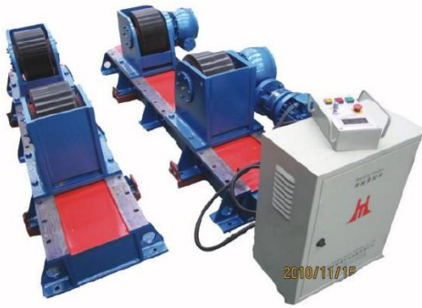
> 5吨聚氨酯滚轮架 / 5Ton with Black PU Rollers