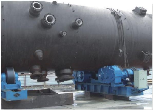
> HGK-500 使用中 / Using of HGK-500