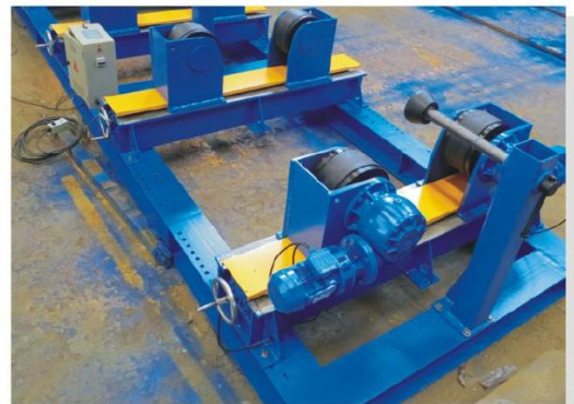
> 高速涂装滚轮架 / High-Speed Coating welding rotator