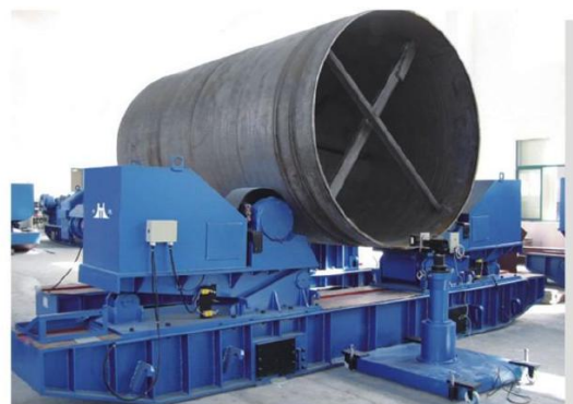
> 自动防窜滚轮架 / Auto anti-drifting rotator