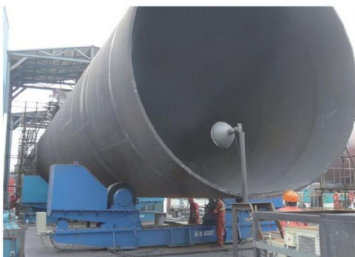
> 400吨手动防窜滚轮架 / 400T Manual anti-drifting rotator