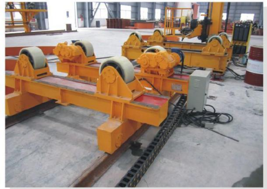
> 移动式可调滚轮架 / Movable Type