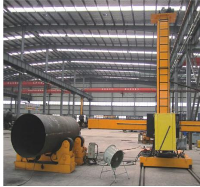
➤ 操作机和滚轮架配套使用 Manipulator and rotator work together