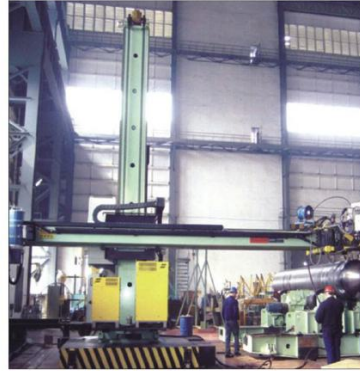
➤ 重型压力容器焊接设备 Heavy pressure vessel complete welding equipments