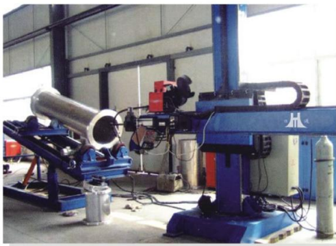
➤ 精密自动焊接中心 Precise auto-welding center