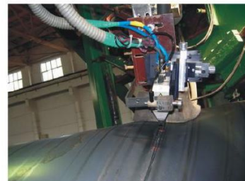
> 激光焊缝跟踪 Laser seam tracking