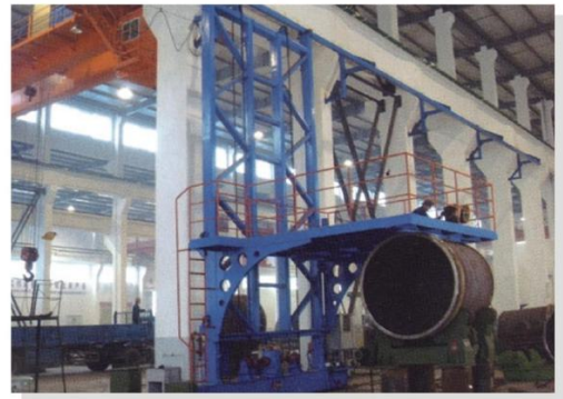
➤ 悬挂式焊接机 Suspension-type manipulator