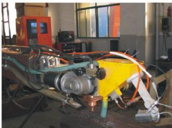
> 机头加摄像头 Welding head and camera