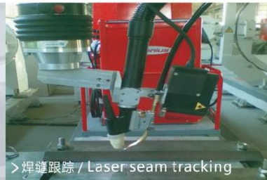
> 焊缝跟踪 / Laser seam tracking