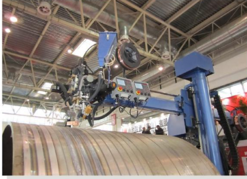
➤ 外环缝焊接 Outside seam welding