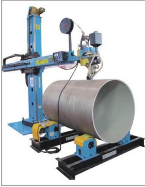
➤ 操作机和滚轮架配套使用 Manipulator and rotator work together