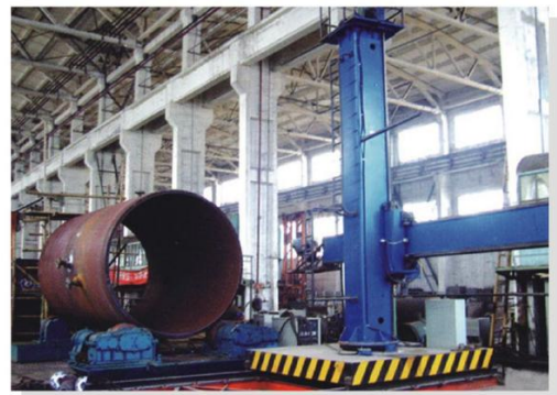
➤ 重型焊接中心 Heavy-duty welding center