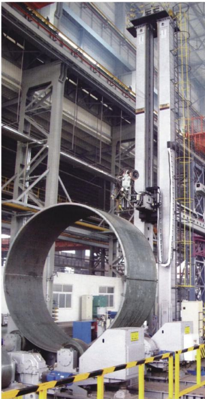
◁ 14x10m操作机 14x10m welding column and boom