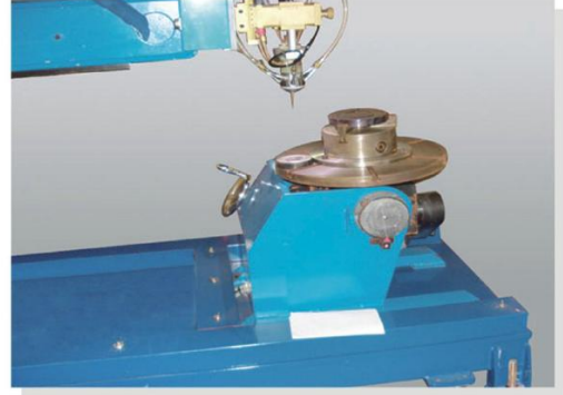
➤ 操作机和变位机配套 Manipulator and positioner work together