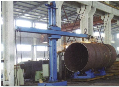
➤ 固定带回转式操作机 Fixed and rotating welding manipulator